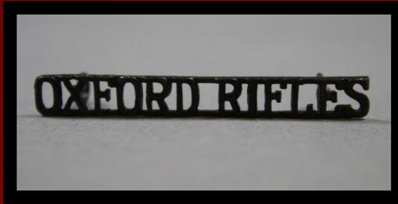
RCRM 2015.024.005, 1920-1954