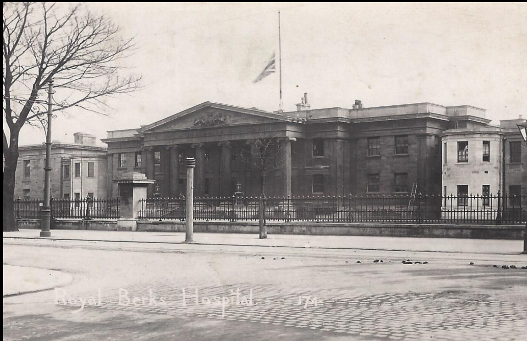
Royal Berks Hospital. 174