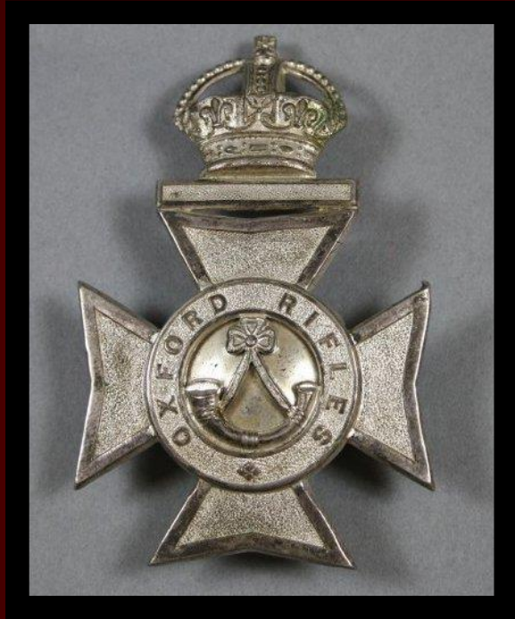
RCRM 2015.024.001, 1920-1936

Insignia representative of the Oxford Rifles, the first militia unit raised in Oxford County in 1798. In 1954, the Oxford Rifles amalgamated with the Canadian Fusiliers to form a militia unit designated as the 3 rd Battalion, The Royal Canadian Regiment (London and Oxford Fusiliers). In 1970, the Oxford Rifles were officially decommissioned and their battle honours are perpetuated by the 4 th Battalion, The Royal Canadian Regiment.