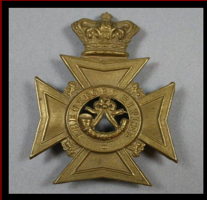
RCRM 2015.024.003, pre 1900